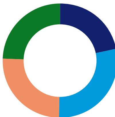
Breakdown by risk category as at December 31, 2020 (as a % of portfolio)

The defensive allocation resulting from an underweight position in corporates and an overweight position in government-related bonds compared to the benchmark had a negative impact on the relative performance of the sub-fund. The selection effect and curve carry contribution were neutral on a portfolio level. The curve change contribution was positive.