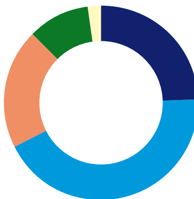
Breakdown by duration as at December 31, 2020 (as a % of portfolio)