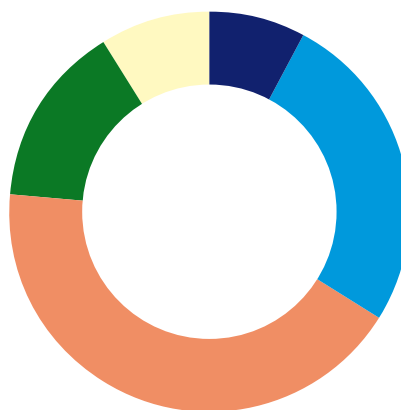
Breakdown by duration as at December 31, 2020 (as a % of portfolio)